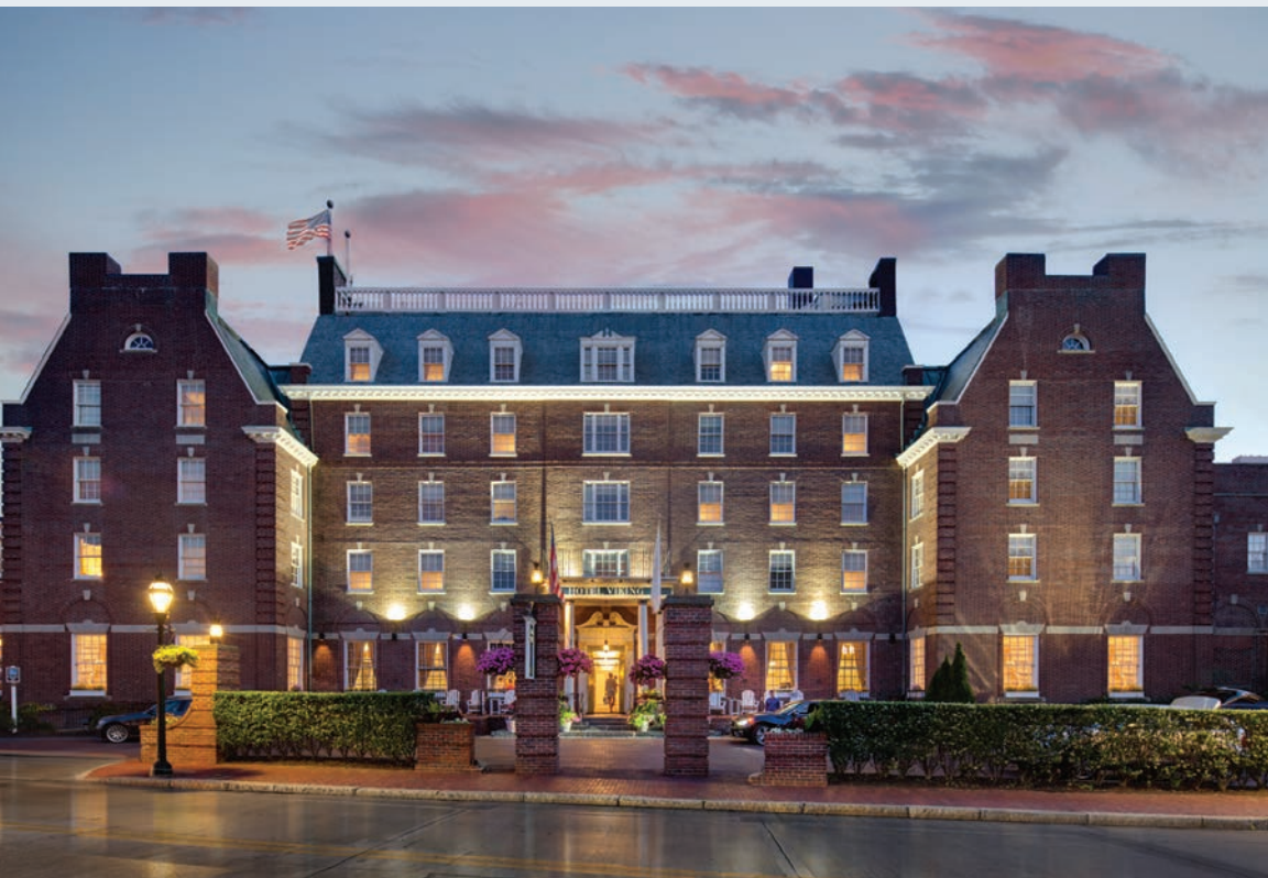
OPPOSITE: The Hotel Viking