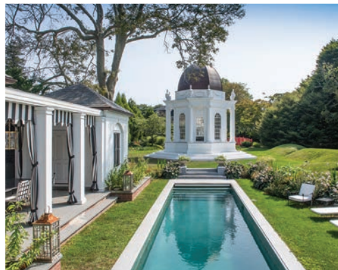
CLOCKWISE FROM LEFT: Hale House, Center for the Study of Hale Family Art, Bellevue House