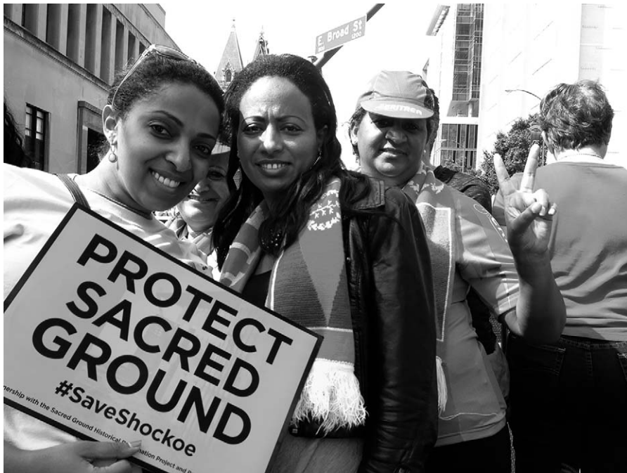
The conservation of Shockoe Bottom is the result of a community-driven planning process.

made extraordinary contributions. For example, when social justice advocates, artists, and preservationists restore sites in North Carolina like the childhood home of civil rights activist, lawyer, and author Pauli Murray in Durham and the birthplace of pianist, composer, and vocalist Nina Simone in Tryon, it showcases both the imbued elegance of simple, unadorned houses, as well as the political activism and indelible artistry of African American women.