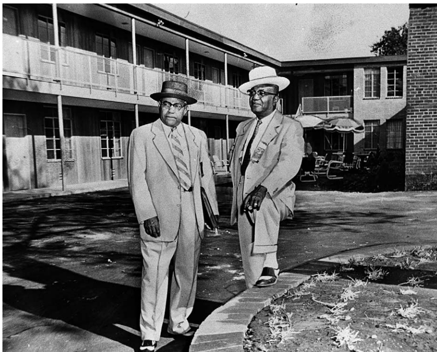
The A. G. Gaston Motel was built in 1954 as a place of luxury for African Americans during segregation.

a new generation of activists to advocate for African American historic places. Their contributions strengthen our understanding of history and, ultimately, help to reconstruct a national identity that reflects America's diversity. Protecting and preserving our tangible and intangible cultural heritage fulfills our need to connect to the past while providing a framework of ideals for our future. The lessons learned from the preservation of African American historic sites across the country, beginning with Cedar Hill, benefit us all.