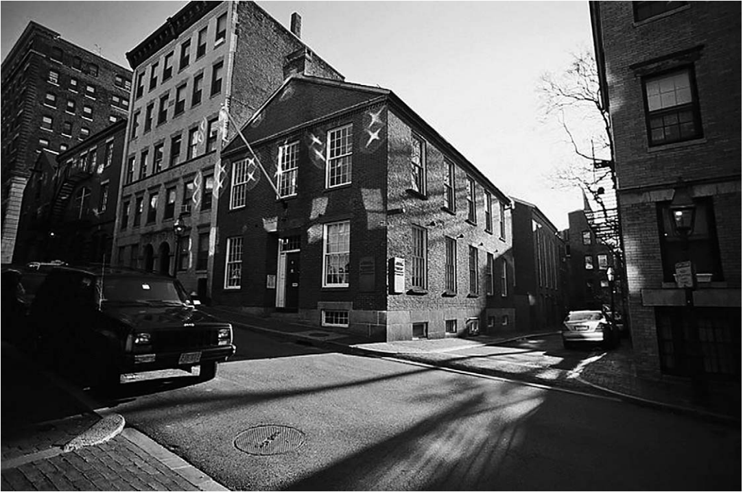
The African Meeting House in Boston relates the story of the abolitionist movement as the embodiment of social change.

a painful chapter of American history, these ancestral spaces can connect African Americans to our forebears while forcing our nation to face the unfinished progress of emancipation and equality. Through preservation practice, community activists and preservation organizations joined forces in 2015 to eliminate the impending threat of incompatible development by defeating a $79.6 million proposal to construct a minor league baseball stadium in Shockoe Bottom. Although its future continues to be debated and negotiated, the Richmond community has shaped a new vision for the site through a community-driven planning process that seeks to conserve this archeological site and sacred ground. In preserving Shockoe Bottom, history is reclaimed to heal and reconcile our nation's past injustice and to honor the resilient nature of our African American ancestors. Such stories and places might otherwise be lost because the practice of urban renewal has led to the abandonment and erasure of African American historic sites in urban areas across the country.