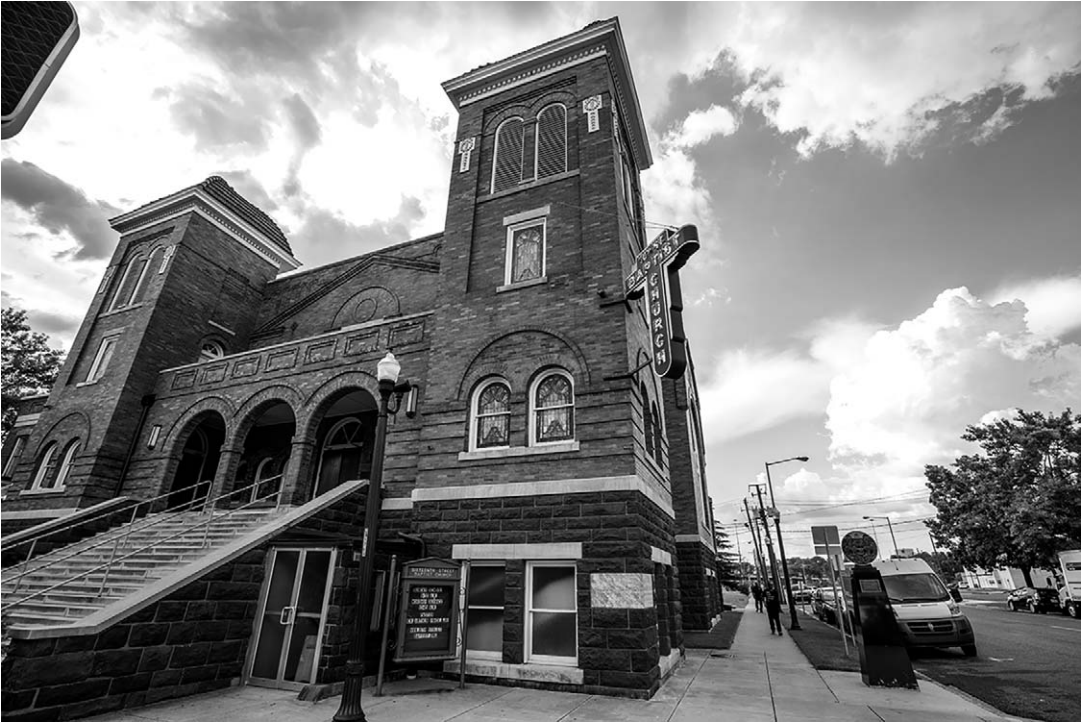
The Sixteenth Street Baptist Church is one of several Civil Rights Movement landmarks in Birmingham where visitors can experience tangible history.

“Project C,” for defeating segregation across the South. In 1963, armed only with the truth and their fearless resolve in the spiritual battle against immorality, these men, women, and children tested and affirmed the timeless idea that purposeful collective action can change the world. Today at these sites, visitors experience a multilayered, visceral history and learn from the stories of courage, freedom, and community organizing that has shaped who we are as a people and a nation today. In 2017, President Barack Obama established national monuments in Alabama and South Carolina to preserve America’s sites of activism, achievement, and community.