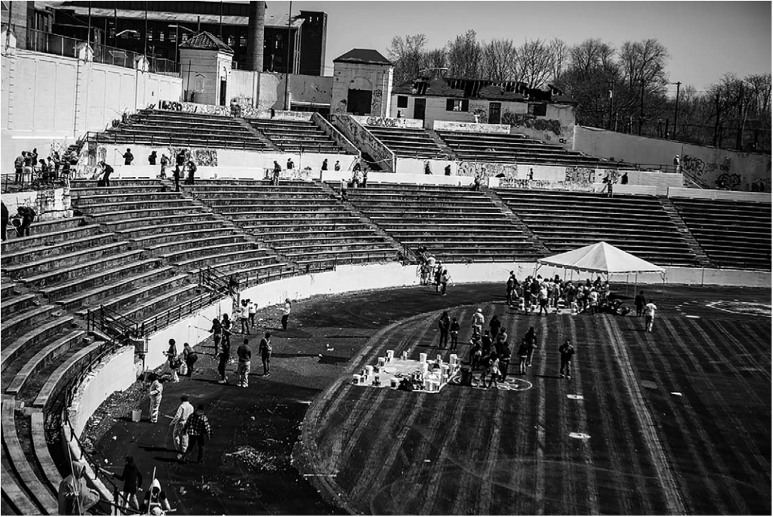
As part of the National Trust's Hands-On Preservation Experience Crew, seven hundred volunteers were enlisted to paint the interior of Hinchliffe Stadium, a vacant Negro League baseball stadium.

Black Lives Matter movement. This is evident even in the success of Selma , Hidden Figures , Black Panther , Hamilton , and Lemonade , which have revealed a deep hunger for more African American representation in stories and American culture.