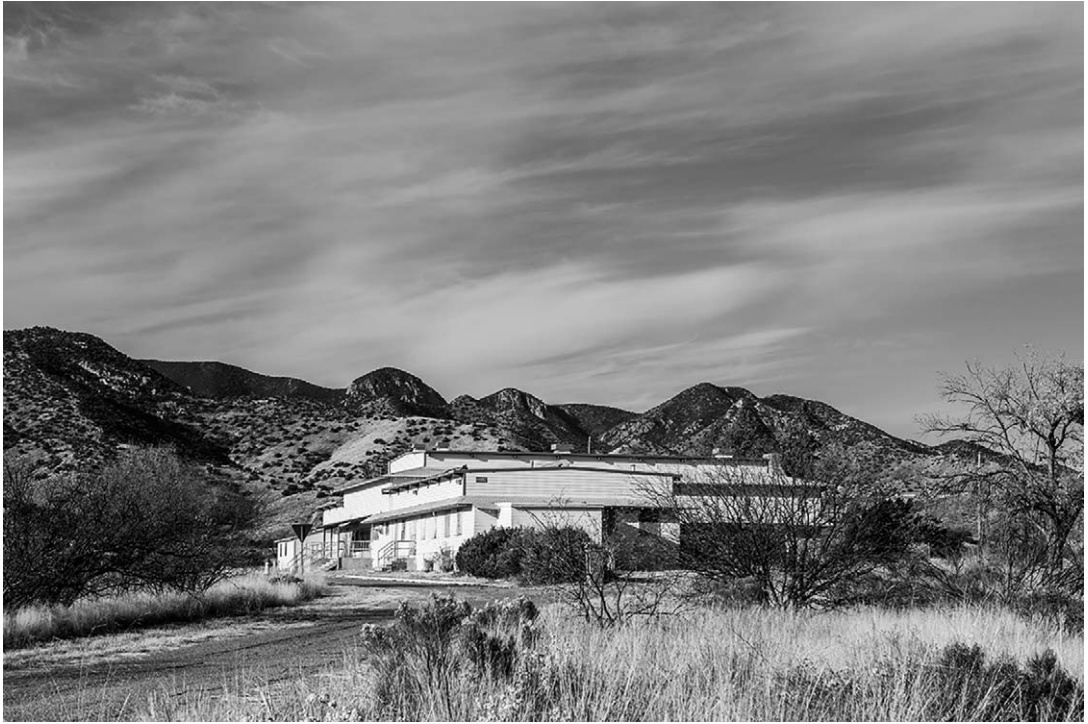
The Mountain View Officers' Club at Fort Huachuca, Arizona, was listed as one of America's 11 Most Endangered Historic Places in 2013. While the US Army Garrison proposes its demolition, the National Trust and its partners believe viable reuse options exist.

Transcendence. When the home's future was threatened, concerned citizens were able to use local designation to defend the significance of the Coltrane home from an irreversible fate and in 2004, the property was designated a Huntington Historic Landmark.