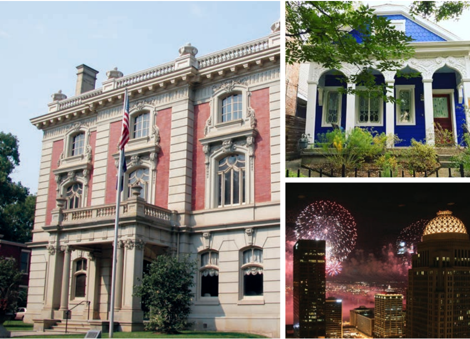
CLOCKWISE FROM LEFT: Filson Historical Society; Louisville house; Fireworks over the Ohio River