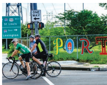
CLOCKWISE FROM LEFT: Brennan House; 21c Museum Hotel; Portland Neighborhood