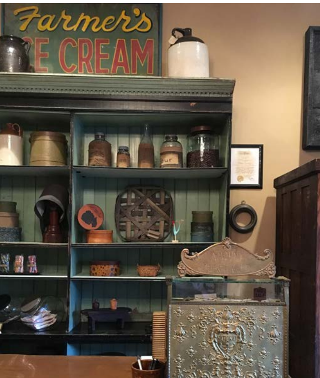
LEFT TO RIGHT: Bloomfield, KY Main Street; Walnut Groves