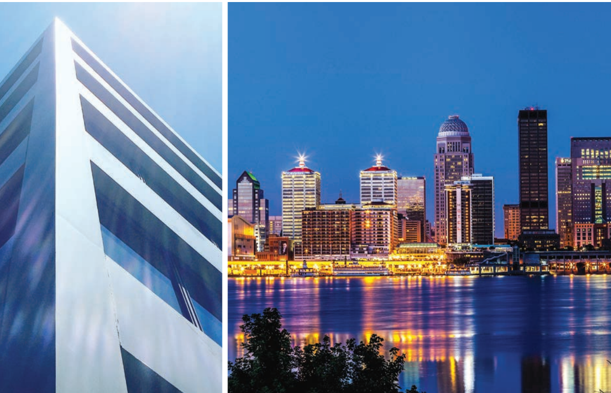
CLOCKWISE FROM LEFT: The American Life Building; Louisville skyline at night