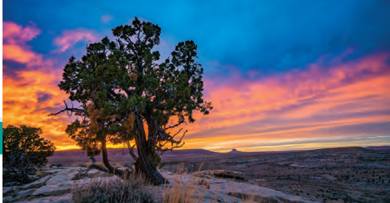
The Ojito Wilderness in Sandoval County, New Mexico is administered by the Bureau of Land Management. Established in 2005, the 11,823 acre area protects mesas, canyons, and badlands with archaeological evidence of Pueblo, Navajo, and Spanish colonial settlements.

In FY 2020, Congress provided $1.5 million in funding directed to the NCRIMS. In FY 2021, Congress provided an additional $1 million for the program's predictive modeling capacity. Recent successes include a BLM California effort to support rights-of-way