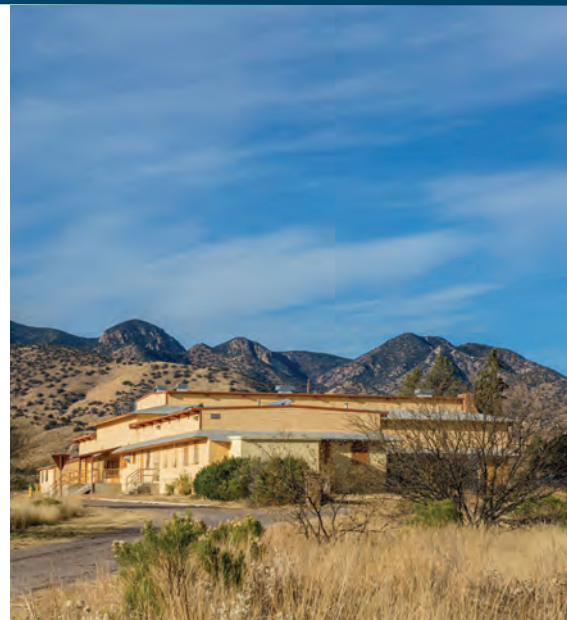
Completed in the fall of 1942, the Mountain View Officers’ Club at Fort Huachuca, AZ, is one of only two documented World War II-era African-American officers’ clubs in the U.S. Army. Following the Section 106 process, the Army proposed to rehabilitate and reuse the building as a multipurpose facility that honors the history of the site and fulfills pressing needs for the community.

The ACHP also performs a critical role in the long-range planning necessary to respond to natural disasters as well as in the emergency response and recovery from disasters.