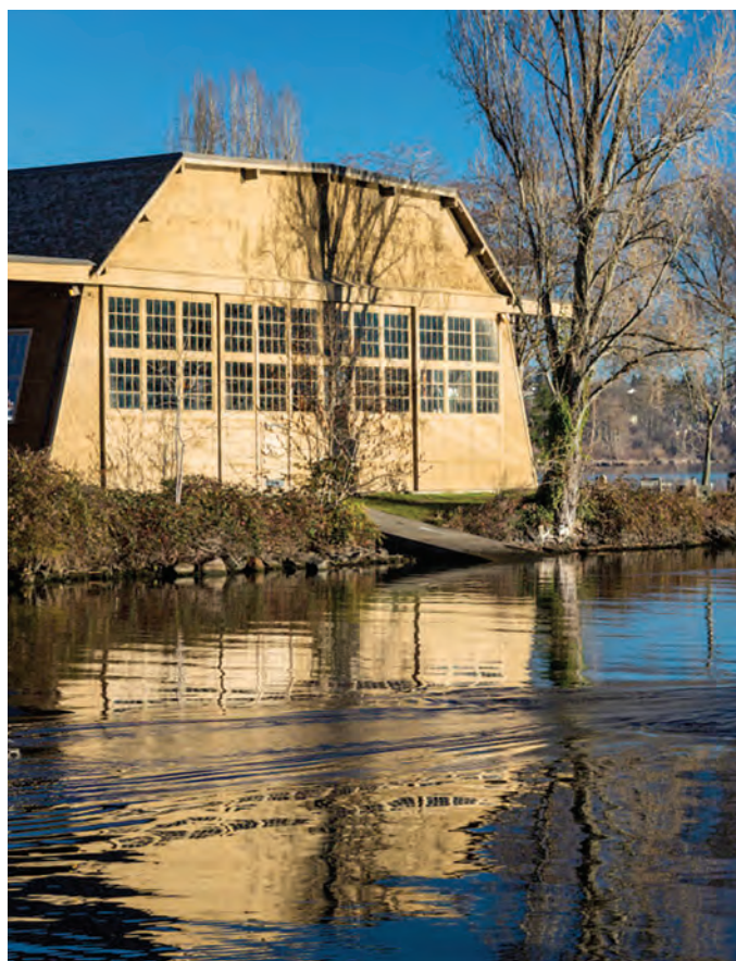
The Shell House at the University of Washington received $499,975 for its stabilization. The structure was the home to UW rowing team for several decades and was where the boat which carried the UW team to gold at the 1936 Olympics was built. That victory is the subject of the acclaimed novel "The Boys in the Boat" by Daniel James Brown, which will be an upcoming film directed by George Clooney.

The SAT grant program's completed restoration and preservation projects include Martin Luther King's Ebenezer Baptist Church and the iconic Star-Spangled Banner that flew above Fort McHenry during the War of 1812 and that now hangs in the Smithsonian National Museum of American History. Many diverse sites and stories have also benefited from the funding opportunities provided by the SAT grant program, including the poems carved by Chinese immigrants into the walls of Angel Island; Mesa Verde's cliff dwellings and associated collections of Native American artifacts; the complex at Fort Snelling; and the Harriet Tubman House in Auburn, NY.