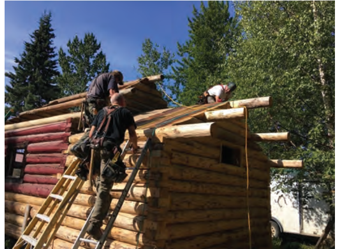
Red John's Cabin was built in the 1930s by an early developer of gold mines near Talkeetna, Alaska. It suffered from rotted logs, a leaky roof, and an uneven foundation. The property utilized the federal historic tax credit program to finance its restoration and now serves as a vacation rental at the base of iconic Denali National Park and Preserve.