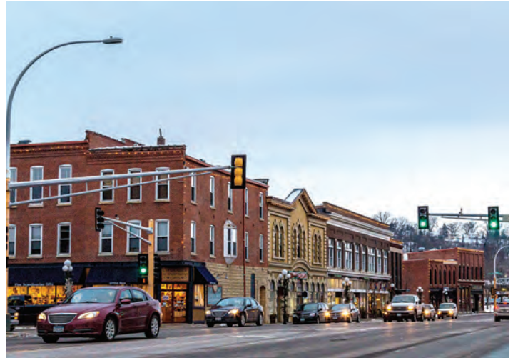
The Preservation Alliance of Minnesota and Rethos: Places Reimagined, the coordinating partner of the Minnesota Main Street program, received $700,000 to build a grant program, “Looking Up,” for Main Street building owners to boost investment in their upper floor spaces. Many Minnesota Main Street communities, like Red Wing, experience underutilized upper floors.

The Paul Bruhn Historic Revitalization Grants are designed to foster economic development while preserving the history of rural communities by awarding grants to rehabilitate historic properties of significance in areas defined as rural by the U.S. Census (population less than 50,000). Under the program, states, Tribes, Certified Local Governments, or non-profits can receive funds that are then sub-granted to eligible properties for preservation projects at National Register Historic Sites. All of the awarded projects are bricks and mortar, job-creating projects, including architectural and engineering services and physical building preservation.