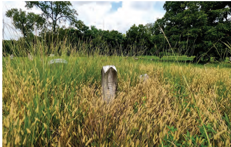
Incorporated in 1875, Olivewood Cemetery in Houston, Texas, is one of the oldest-known platted African American cemeteries in Houston, with more than 4,000 burials on its 7.5-acre site. It was named as one of America's 11 Most Endangered Historic Places of 2022.

For more than five years, advocates urged Congress to pass legislation that protects and preserves historic African American cemeteries. This newly created program will allow descendant-led and preservation organizations working to protect African American burial grounds to receive funding to preserve these sacred landscapes. Assisting with the discovery of these places of tribute and memory ahead of commercial development will help avoid disturbances of these sacred places and aid family members, descendants, and community members in honoring and remembering their shared past.