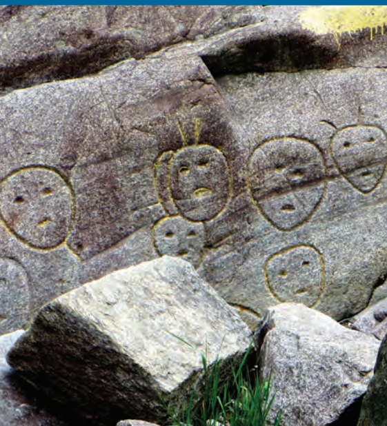
The Elnu Abenaki Tribe and the town of Rockingham, Vermont was awarded a grant to support amending and enhancing the existing National Register of Historic Places listing for the Bellows Falls petroglyph site, Kchi Pöntegok. The site is a rare instance of petroglyphs in New England and marks a sacred place.