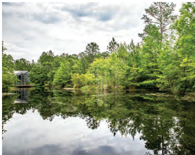
The Mississippi Gulf Coast National Heritage Area encompasses the six southernmost counties in Mississippi and highlights the rich historical, ecological, and cultural attributes of the area. Heritage tourism economically benefits the entire region and supports continued investments in preserving this dynamic collection of communities, sites, and landscapes.

National Heritage Areas are partnerships among the National Park Service, states, and local communities, in which the NPS supports state and local conservation through federal recognition, seed money, and technical assistance. NHAs are designated by individual legislation with specific provisions for operation unique to the area's specific resources and desired goals. NHAs are often organized around a theme, industry, and/or geographic feature that has influenced our national culture and history. Lands within NHAs remain in state, local, private ownership, or a combination thereof. NHA designation does not affect private property rights.