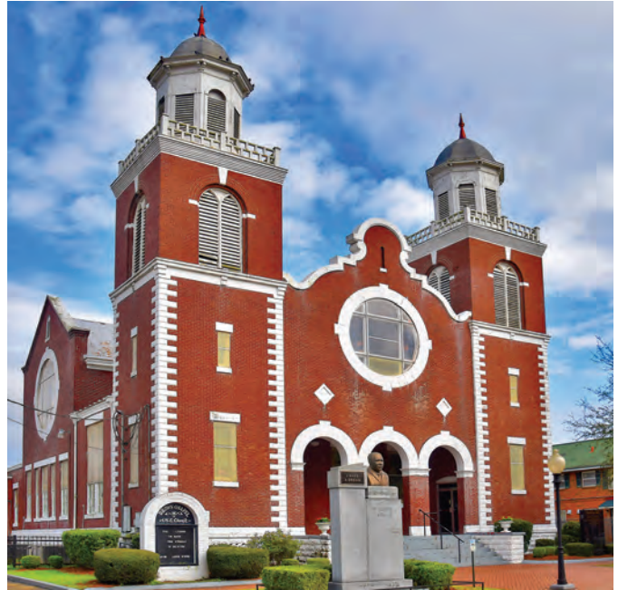
Brown Chapel AME Church played a pivotal role in the Selma to Montgomery marches that helped lead to the passage of the Voting Rights Act of 1965. In FY 2021, it received $500,000 from the AACR grant program for its preservation.

AACR grants fund a broad range of planning, development, and research projects for historic sites including: survey, inventory, documentation, interpretation, education, architectural services, historic structure reports, preservation plans, and “bricks and mortar” repair. Grant projects are split into two categories: preservation projects and history projects. Preservation project grants are for the repair of historic properties. History project grants are for more interpretive work such as exhibit design or historical research. Between FY 2016 and FY 2021, Congress appropriated $80.75 million to the AACR Grant Program, supporting 282 documentation, survey, planning, education, interpretation, and bricks and mortar preservation projects. The FY 2020 funding round expanded the scope of the program from projects solely related to the Civil Rights Movement of the 20th century to sites associated with the African American struggle for equal rights from the transatlantic slave trade onwards.