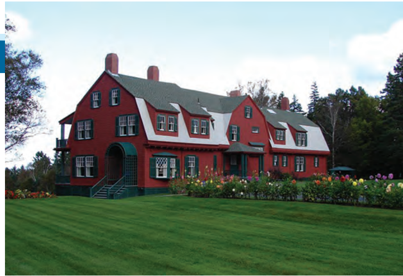
Located on the border of Maine and New Brunswick, Canada, the Roosevelt Campobello International Park is staffed and visited equally by Americans and Canadians. It serves as a memorial to President Franklin D. Roosevelt and a symbol of international friendship and cooperation.

The diverse portfolio of NPS affiliated areas ranges from a singular statue of Ben Franklin in Philadelphia to over a million acres at the Pinelands National Reserve in New Jersey. In many cases, the affiliated areas are titled national historic sites or national memorials that interpret the rich history of our nation. For example, the Jamestown National Historic Site in Virginia, designated in 1940, was the first affiliated area.