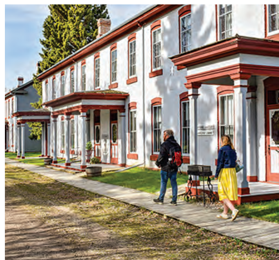
Fort Totten, North Dakota is one of the best-preserved frontier military posts in the United States. The fort was built between 1868 and 1873 as a military outpost, but it served for most of its history as the Fort Totten Indian Industrial School.

Baltimore is part of the ancestral homelands of the Piscataway and the Susquehannock, and many other Native people who have lived in the city over time. After World War II, thousands of Lumbee Tribe members, whose ancestral lands are in North Carolina, migrated to Baltimore City, seeking a better quality of life. They settled within a 64-block area in East Baltimore, referred to as "the reservation." The Maryland Historical Trust will prepare a National Register Multiple Property Documentation Form to document American Indian heritage in Baltimore City.