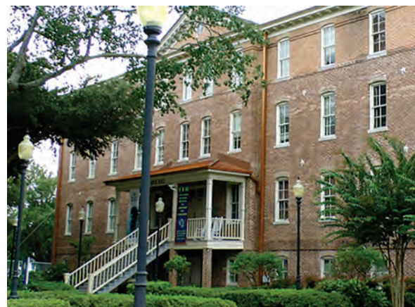
Ayer Hall houses the Margaret Walker Center at Jackson State University, an archive and museum dedicated to the preservation, interpretation, and dissemination of African American history and culture.

Since Reconstruction, Historically Black Colleges and Universities (HBCUs) have provided African Americans with greater access to higher education and told the story of the struggle for social justice. The historic buildings and landscapes on HBCU campuses—many of which were built and designed by African American architects, planners, and students—hold a diverse and empowering collection of stories and artifacts that help tell the full American story and reflect the important legacy of the African American educational experience and communities that surround and support these institutions.