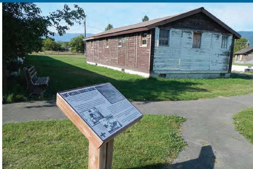
The Historical Museum at Fort Missoula, MT received $533,000 from the Japanese American Confinement Sites grant program in FY 2020 to rehabilitate and reconstruct two original barrack buildings from the Fort Missoula Internment Camp. Construction of these missing barracks will enhance the public's understanding of the original internment camp.

The National Park Service (NPS) administers many of our nation's most significant historic preservation programs that help preserve a more complete history. Within its cultural programs, the NPS manages the National Register of Historic Places (National Register) and National Historic Landmarks (NHLs), certifies federal Historic Tax Credit projects, coordinates federal archaeology programs, and provides funding through the Native American Graves Protection and Repatriation Act Grants, Japanese American Confinement Sites Grants, and American Battlefield Protection Program Assistance Grants.