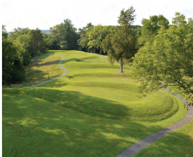
The Serpent Mound is a National Historic Landmark in Peebles, Ohio built by the Shawnee tribe. In 2021, the state of Ohio welcomed the tribe back to the mound. The Chief and THPO of the Shawnee Tribe and the Chief and THPO of the Eastern Shawnee Tribe returned from their reservations in Oklahoma to hold presentations on the Shawnee tribe's relationship to the mound.