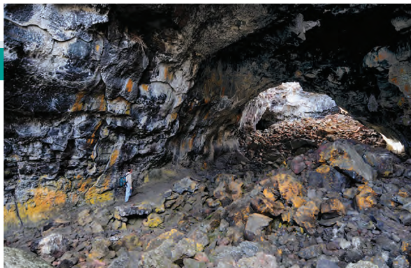
Craters of the Moon National Monument and Preserve in south-central Idaho is cooperatively managed by the National Park Service and the Bureau of Land Management. It encompasses three lava fields, open rift cracks, caves, and other volcanic features. Indian Tunnel, shown here, is an 800 foot long lava tube cave that has been used for shelter and exploration for hundreds of years to both Indigenous peoples and American pioneers heading West.