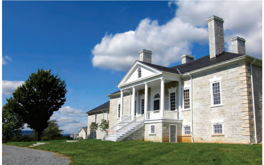
Cedar Creek and Belle Grove National Historical Park in Virginia's Shenandoah Valley is part of the Reconstruction Era National Historic Network for its interpretation of the experiences of African Americans on its plantation before, during, and after the Civil War.

The John D. Dingell, Jr. Conservation, Management, and Recreation Act was signed into law on March 12, 2019, and created the Reconstruction Era National Historic Network. The network helps to preserve and interpret sites and stories important to understanding the successes and struggles of African Americans in the decades following the Civil War. It includes almost 90 sites, such