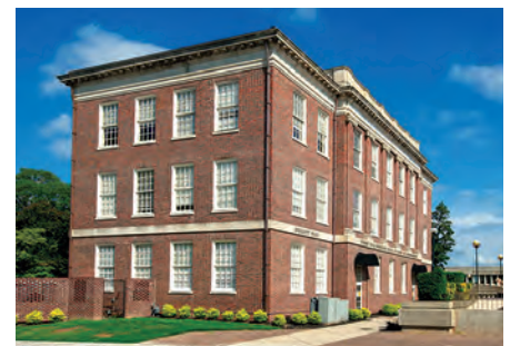
Duckett Hall, erected in 1925, is Benedict College's third-oldest building and one of five structures in the College's Historic District.

In 1887, Jackson Hall was the first building constructed as part of Kentucky State University's campus. Upgrades will address structural issues, improve space use and accessibility and implement environmental upgrades that will directly support the museum and the Center for Excellence for the Study of Kentucky African Americans.